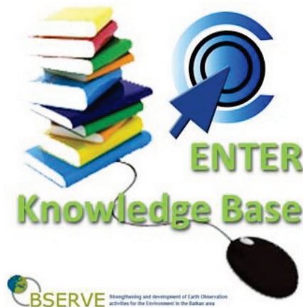
Figure 2: KBR Promo Button

The above general repository categories are divided to numerous subcategories. The files originated from the literature research, coordination activities and networking events of OBSERVE project.